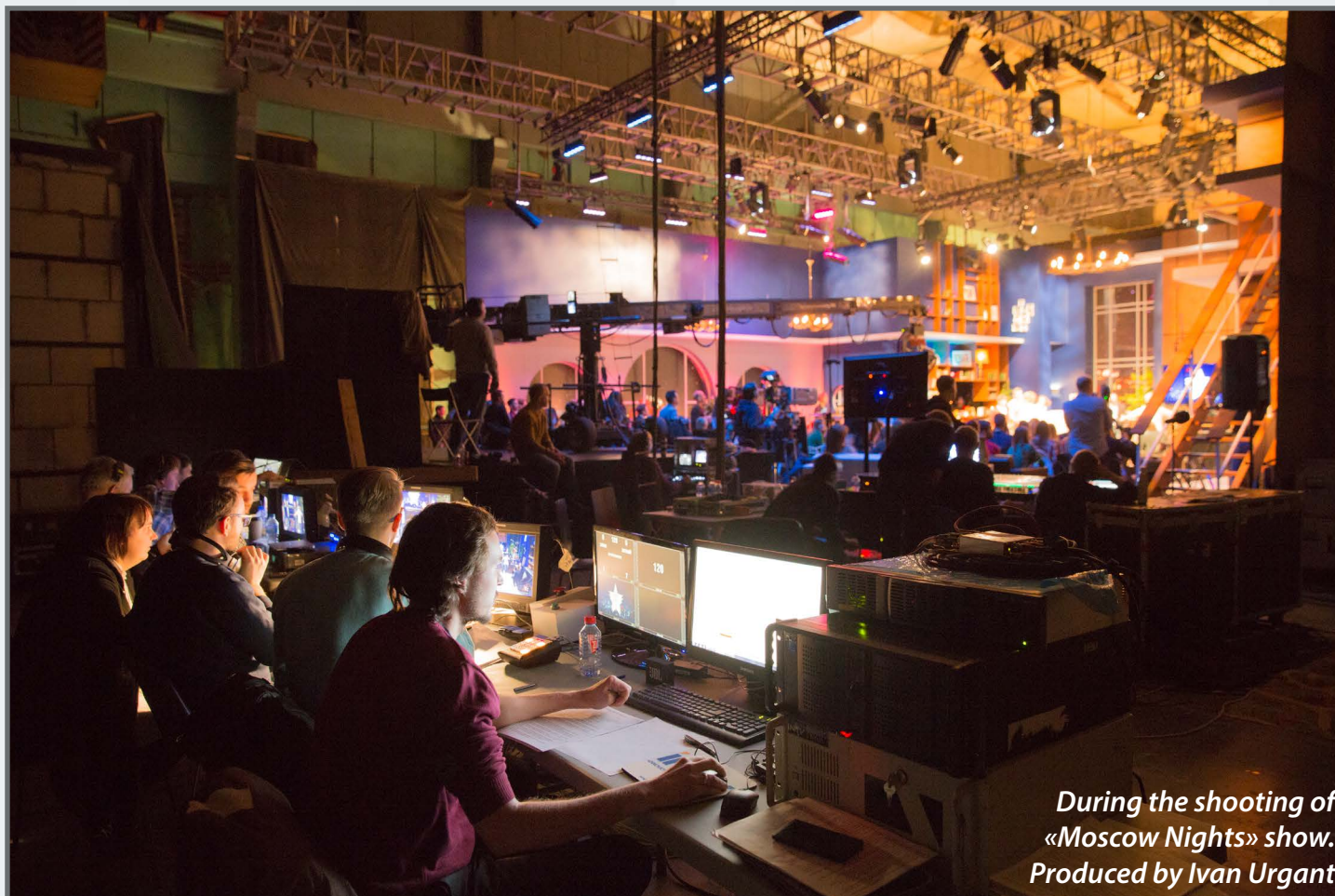
During the shooting of «Moscow Nights» show. Produced by Ivan Urgant

«GameTV.az» CJSC (Baku) is glad to express gratitude to INTV for the creation and support of the software for Azerbaijani local version of «Jeopardy!» intellectual game, aired as «61!». We will be glad to continue cooperation with INTV in the future projects.»